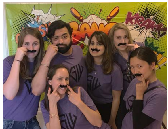
PGY-1s have fun too!