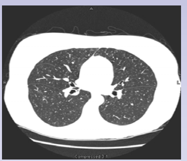
Figure 1b. Chest CT obtained six weeks after initiation of systemic steroid scan showing marked improvement of the diffuse hazy nodules.

Figure 1a. High computed tomography resolution (HRCT) scan of the chest obtained following the first clinic visit revealing multiple centrilobular hazy nodules distributed diffusely throughout both lungs.