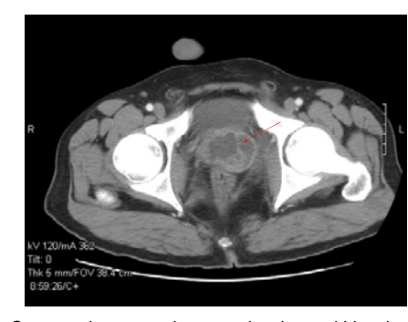
Figure 3: Computed tomography scan showing multi-loculated prostate abscess (arrow)